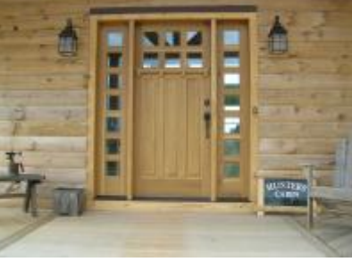
with a 2 car garage. Their Superior Wall Foundation was set in just 4 hours. Jon's craftsmanship is seen in their custom front door and kitchen cabinets. He also installed the in-floor hot water heat. Their

Jon and Tara Hunter built a 2,500 sq. ft. Real Log Home from the Contour V-Groove Log