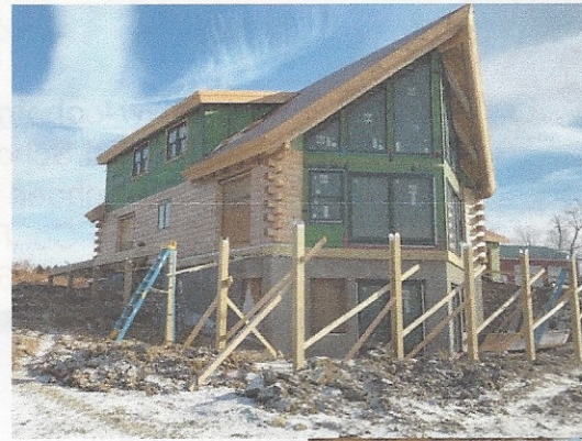
A two-car garage was added, and a Superior Wall Walkout

chosen was a 8"X 8" with a 7" face exposure. Did I mention the word, "retirement"? Together, they mustered the strength to assemble the home with no big issues or mishaps. It was a wet spring in North Collins, yet their goal was to be able to winter over with a roof over their heads. With time to spare, the deadline was meant, and they are as snug as come be for the lake affect snows this season. Congratulations, job well done!!