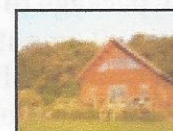
"A Beautiful Place" Rental located just off Keuka Lake, 2 miles south of Penn Yan. Great Weekend!